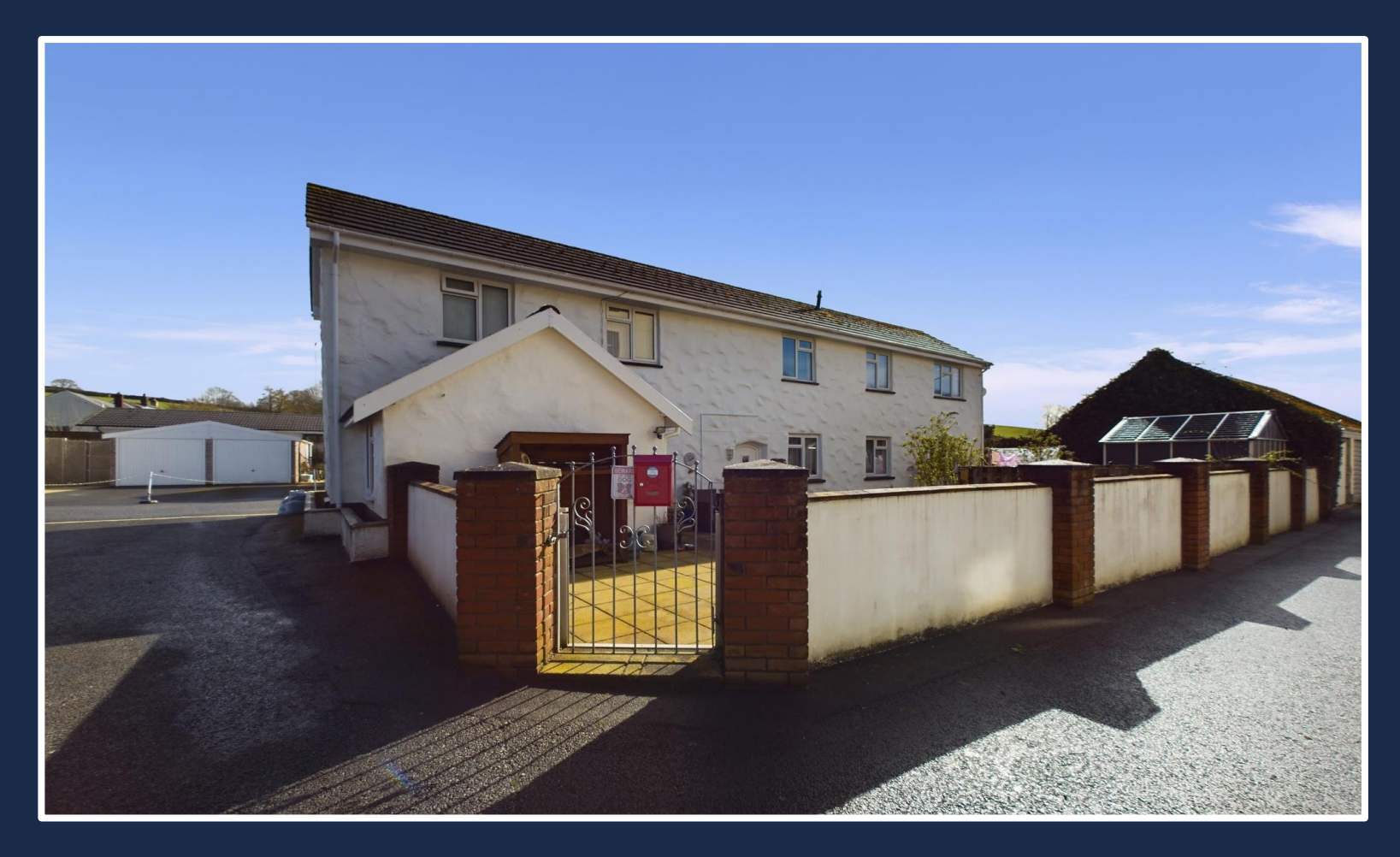
Mill Cottage Mill on the Mole, South Molton, Devon, EX36 3QA